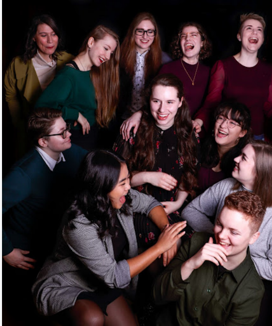
Casey / Women's Jazz Jams / BC

of all backgrounds. We will be sending out a call for nominations, from which we will pick 7-8 immigrant women to showcase throughout our networks and present this distinction to.”