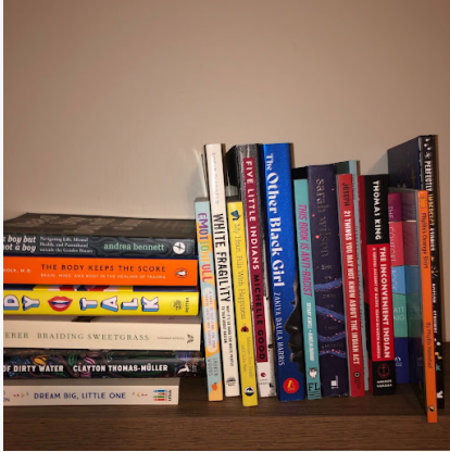
Jessica / Social Justice Library / NL

"Mental health and social justice are one in the same! With our free 'mini community library', we are making mental health and social justice information more accessible for everyone! Our library is quite diverse, we have books available for all ages and some topics include: mental illness, racism, gender diverse representation, Indigenous literature, body image, and so much more!"