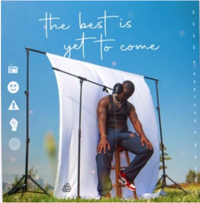
Harmony / Album Soundtrack / NS

“I am currently working on my second film which follows the story of a young black boy trying to follow his dream to become the best artist in Nova Scotia. For my project, I have created a soundtrack album for the film entitled, “The Best is Yet to Come”. The most important goal of this project is to inspire the music community around me to keep pursuing their dreams.”