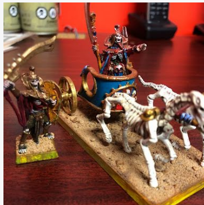
Tristan / Games and Creative Workshop / YT

“We plan to host painting workshops, army building, and battles in Warhammer Fantasy. Warhammer is a fantastic social activity that includes the arts, math, critical thinking, reading comprehension, strategy, collective decision making.”