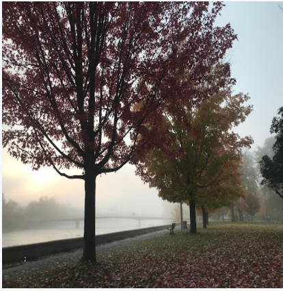
Website: The Neighborhood Story Project