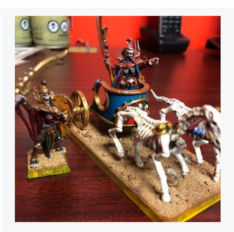
Tristan / Games and Creative Workshop / YT

"We plan to host painting workshops, army building, and battles in Warhammer Fantasy. Warhammer is a fantastic social activity that includes the arts, math, critical thinking, reading comprehension, strategy, collective decision making."